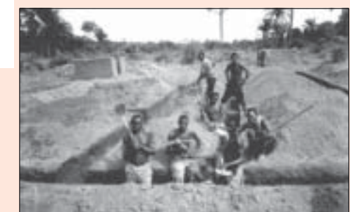
Digging the foundation of the guest house in Baguga.

Pastors, congregations, and groups supporting the LHF mission also receive our regular newsletter: THE WORD AT WORK, released on a quarterly basis.